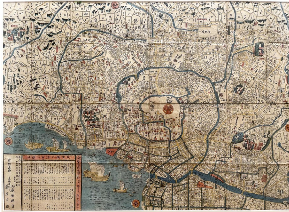
1. ANON. Edo/Tokyo Map. Original framed woodblock map, printed in Japan, c.1850. 815 x 1025 mm.

Some small paper losses throughout which does not detract too much from the overall look of the map. £1,250