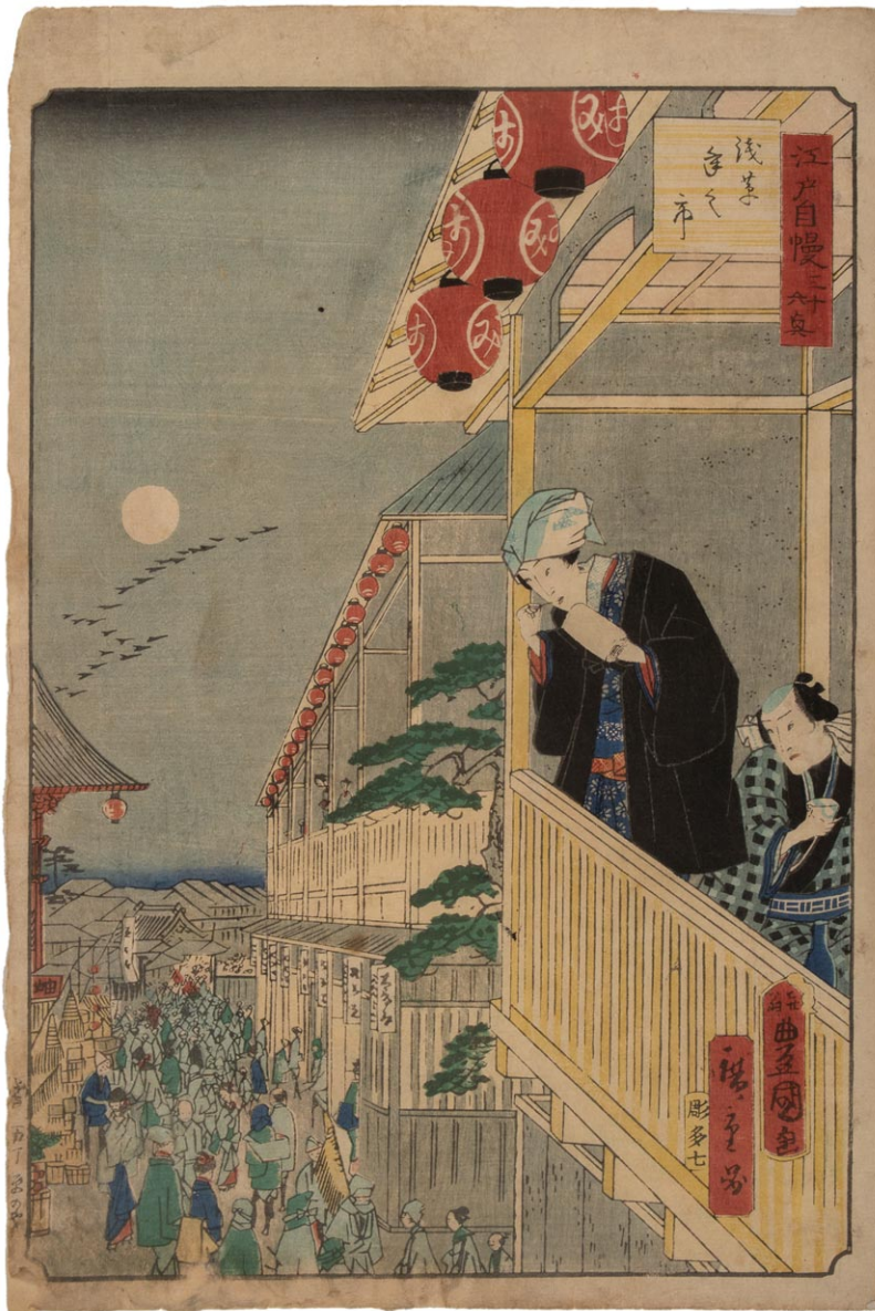
24. HIROSHIGE , Ando (1797-1858). Asakusa Toshi-no-ichi Festival. Original woodblock print, Japan, 1864. 525 x 395 mm. £700