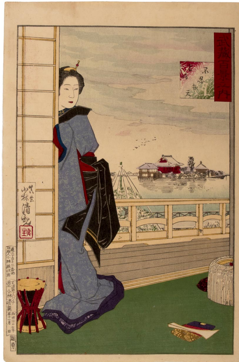
37. KOBAYASHI, Kiyochika (1847-1915). Beauty and Taiko Drum. Original woodblock print, from the series One Hundred Views of Musashi, 1884. 525 x 395 mm. £1,400