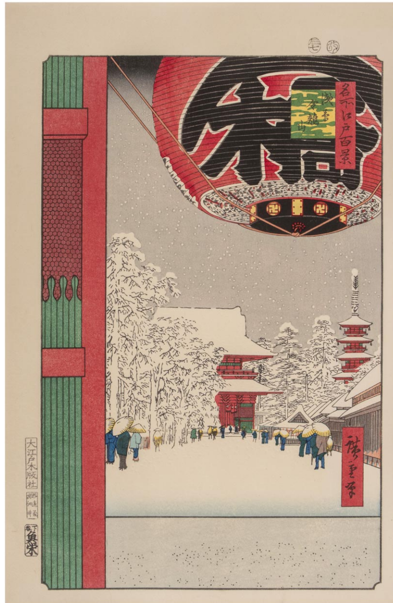
29. HIROSHIGE, Ando (1797-1858). Kinryuzan Temple in Asakusa. Original woodblock after Hiroshige, printed in Japan, 20th Century edition. 595 x 420 mm.