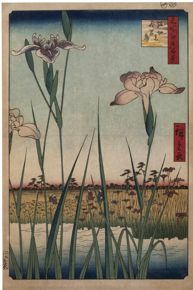
28. HIROSHIGE , Ando (1797-1858). Horikiri Iris Garden. Original woodblock after Hiroshige, printed in Japan, 20th Century edition. 525 x 395 mm. £260