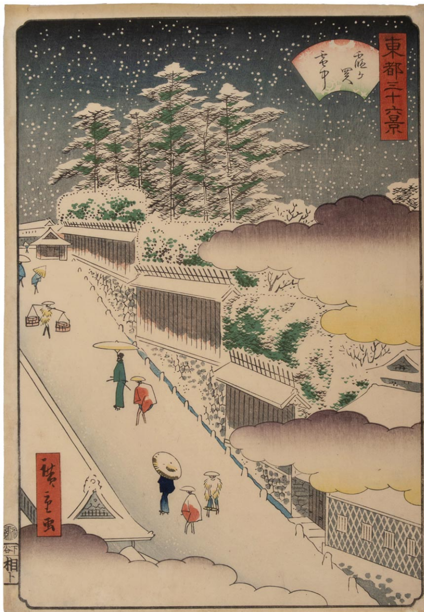
6. HIROSHIGE II, (1826-1869). Kasumigaseki District in the Snow. Original woodblock print, from the series Thirty-Six Views of the Eastern Capital, published by Aito, 1862. 525 x 395 mm. £3,200