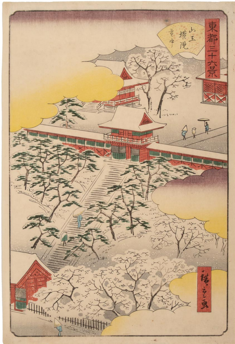
7. HIROSHIGE II, (1826-1869). Sanno Gongen Shrine in the Snow. Original woodblock print, from the series Thirty-Six Views of the Eastern Capital, published by Aito, 1862. 525 x 395 mm. £3,000