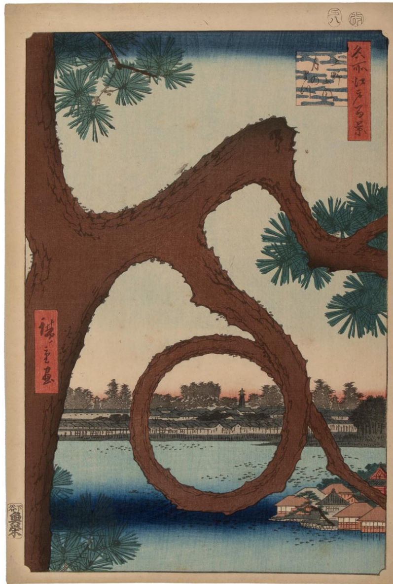
19. HIROSHIGE, Ando (1797-1858). Moon Pine, Ueno. Original woodblock print, from the series "One Hundred Famous Views of Edo," Japan, 1857. 525 x 395 mm. £7,000