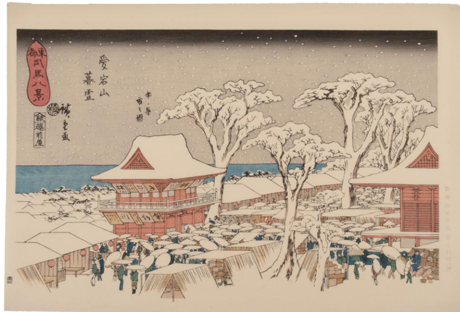
25. HIROSHIGE , Ando (1797-1858). Evening Snow at Atago Hill. Original woodblock after Hiroshige, from the series "Eight Views of Shiba in the Eastern Capital," printed in Japan, 20th Century edition. 405 x 520 mm.

The original was first printed in c.1840.