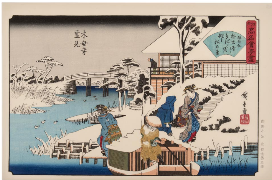
26. HIROSHIGE , Ando (1797-1858). Viewing the Snow at Mokuboji Temple. Original woodblock after Hiroshige, printed in Japan, 20th Century edition. 405 x 520 mm.

The original was first printed in c.1835.