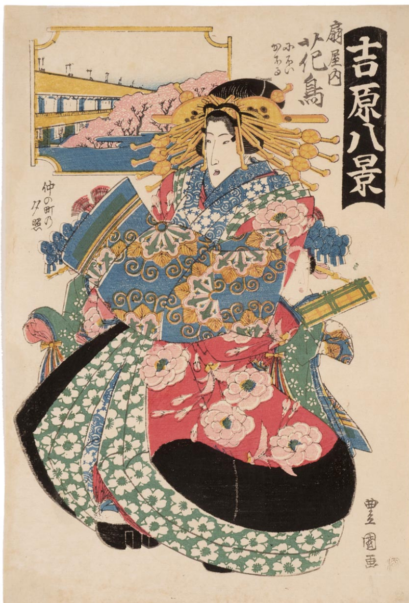
38. TOYOKUNI II, Utagawa (1777-1835). The Courtesan Kacho in the Ogiya House. Original woodblock print, from the series Eight Views of the Yoshiwara, Japan, 1825. 525 x 395 mm. £1,200