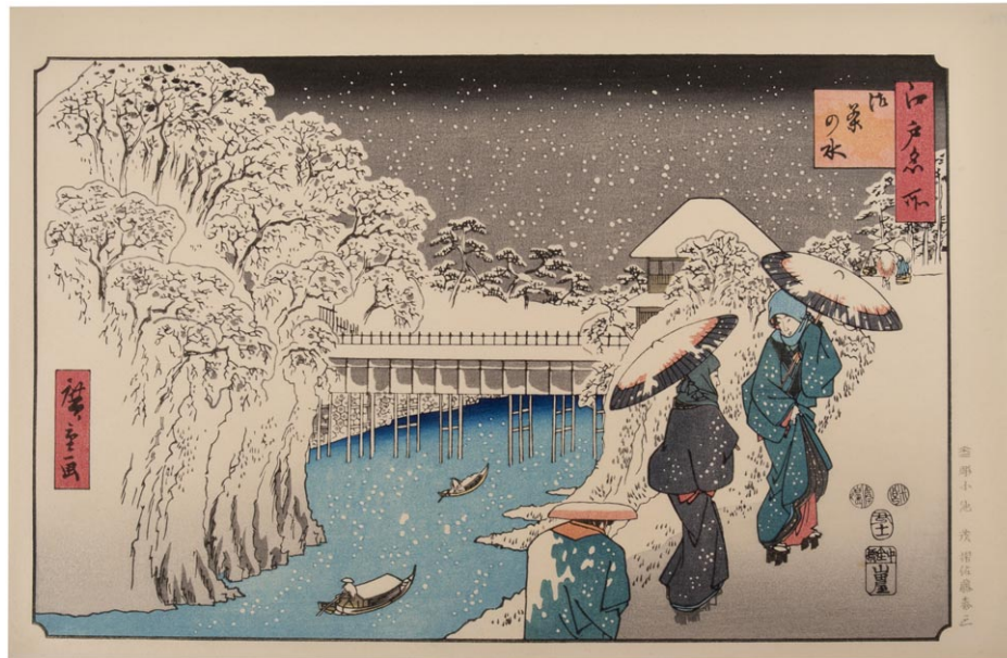
27. HIROSHIGE , Ando (1797-1858). Ochanomizu in Snow. Original woodblock after Hiroshige, printed in Japan, 20th Century edition. 405 x 520 mm.

The original was first printed in c.1830.