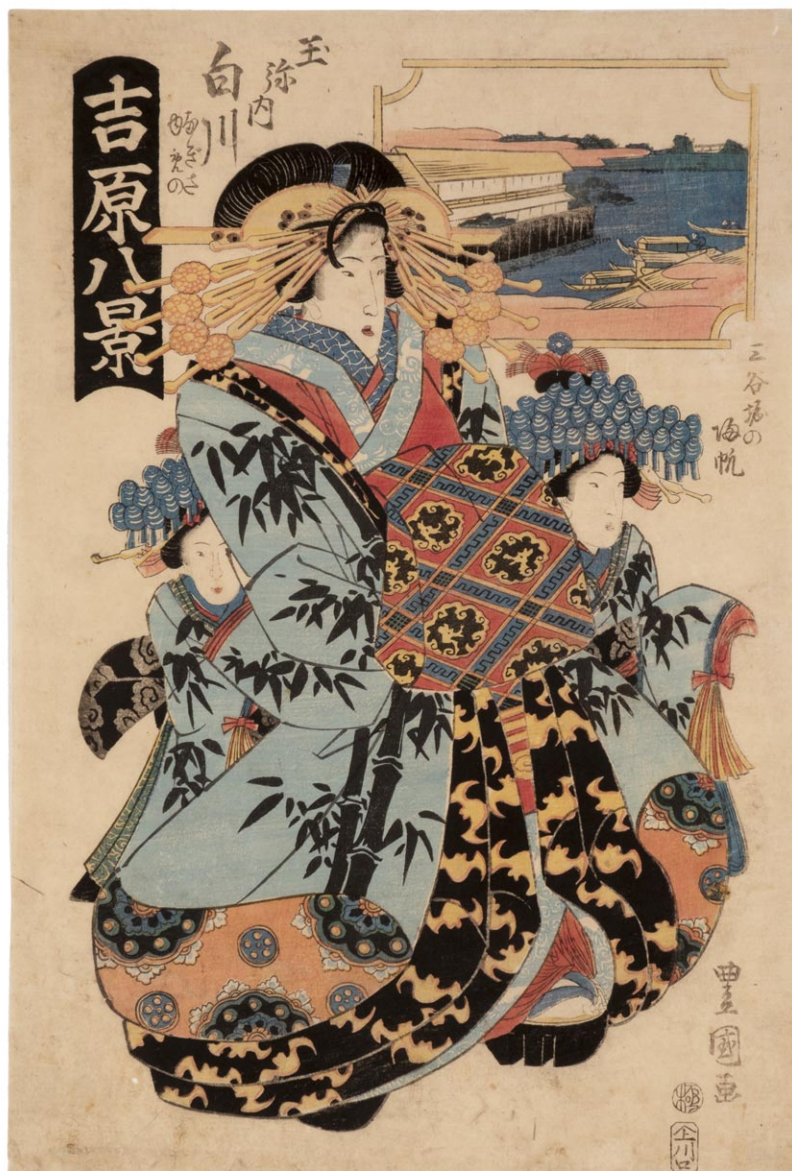
40. TOYOKUNI II, Utagawa (1777-1835). Courtesan Shirakawa of the Tamaya Tea House. Original woodblock print, from the series Eight Views of the Yoshiwara, Japan, c.1830. 525 x 395 mm. £1,950