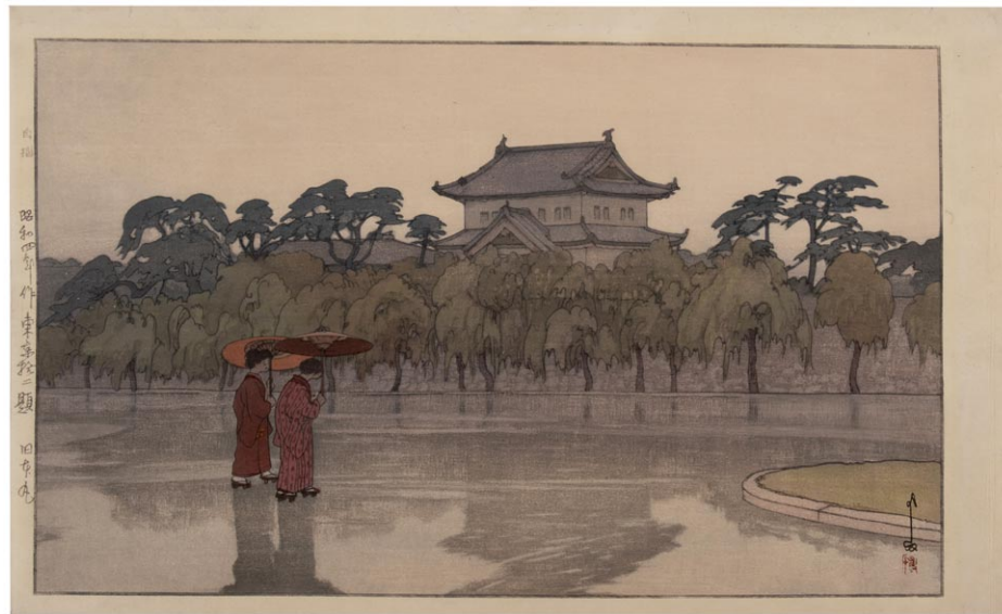
41. YOSHIDA, Hiroshi (1876-1950). Edo Castle. Original woodblock print, Japan, 1929. 405 x 520 mm. £2,950