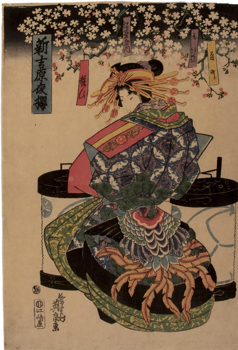
34. KEISAI, Eisen (1790-1848). Courtesan Yosooi of Matsubaya Pleasure House. Original woodblock print, Japan, c.1825. 525 x 395 mm. £2,700