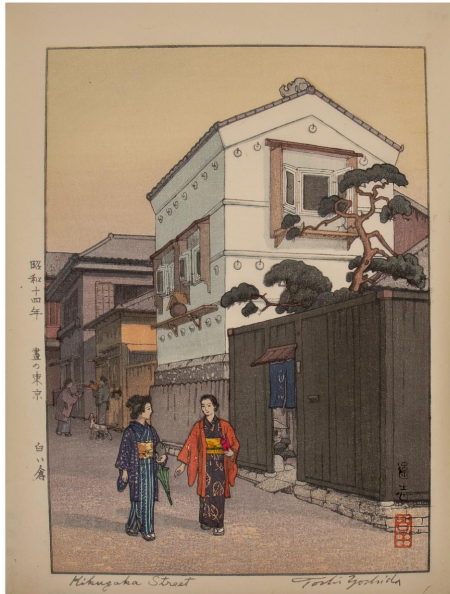
43. YOSHIDA, Toshi (1911-1995). Kikuzaka Street. Original woodblock, printed in Japan, posthumous edition, 20th Century. 405 x 330 mm.

Toshi was associated with the Sosaku-hanga (self-drawn) movement, and son of shin-hanga (collaborative) artist Hiroshi Yoshida. £360