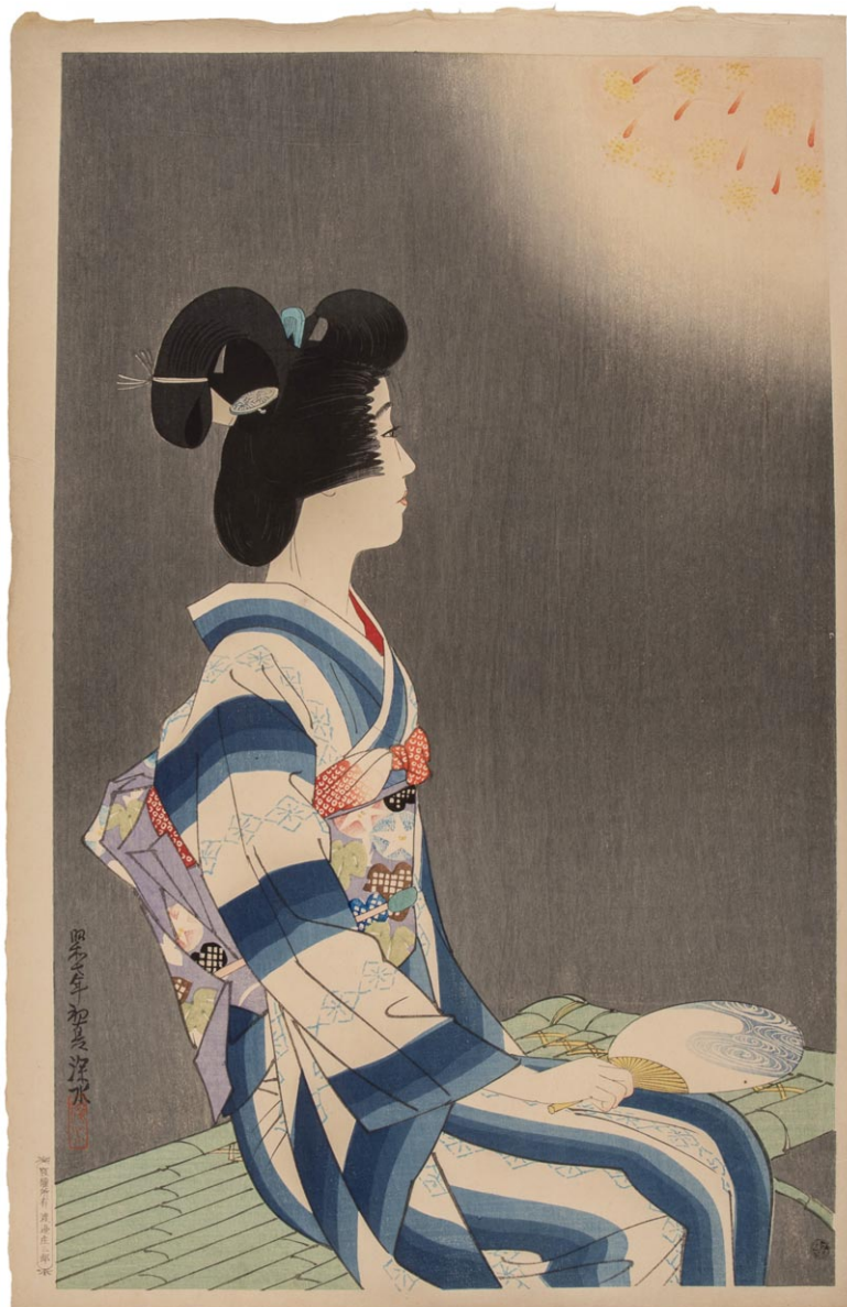
32. Fireworks. ITO, Shinsui (1898-1972). Original woodblock print, printed in Japan, 1932. 570 x 470 mm. £7,000