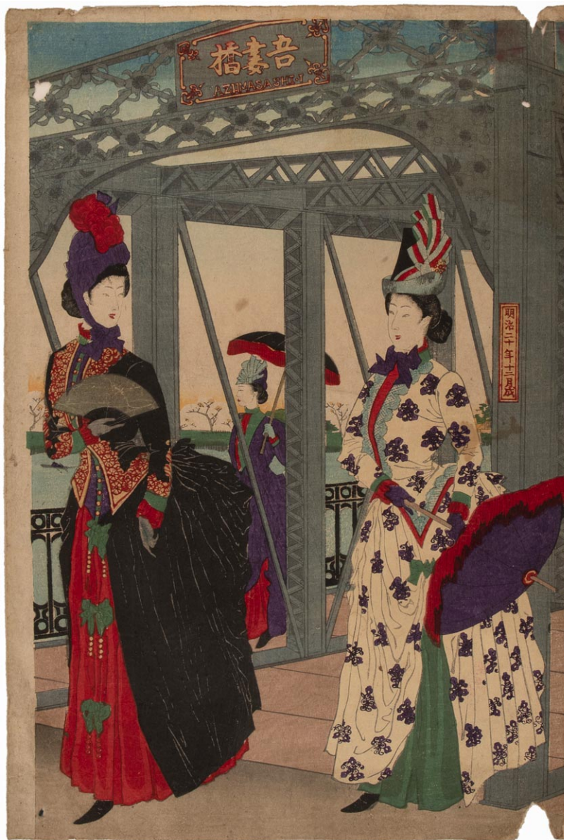
2. HASHIMOTO, Chikanobu (1838-1912). Beauties crossing Azuma Bridge. Original woodblock print, printed in Japan, 1887. 525 x 395 mm.